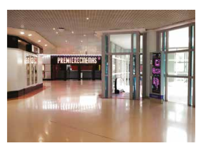
Premiere Cinema : Is an 8 screen cinema also selling snacks and drinks. Located on Level 3.