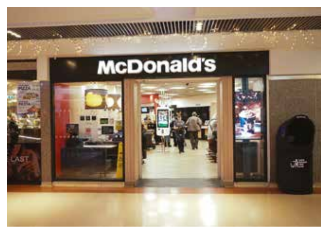
McDonalds : Sells burgers and fast food, it is located on Level 2, near the ASDA link entrance.