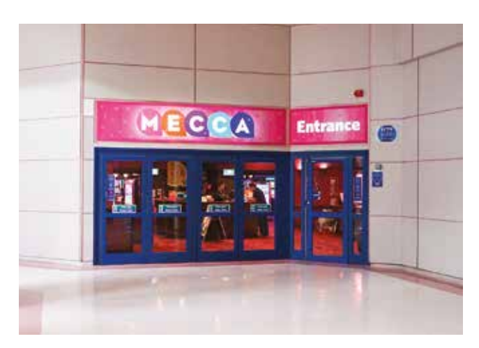
Mecca Bingo: Is a 648 seat Bingo Hall, selling food and drinks. It is located on Level 3