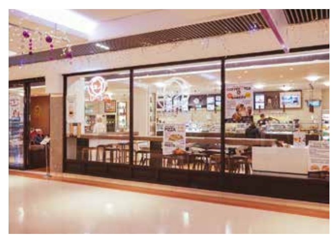
Caffe Della Terra : sells pizza, pasta and coffee. It is located on level 2, near the bus stop entrance.

You can eat at The Mercury; we have identified a number of quieter eateries and places that you can also sit to eat packed lunches.