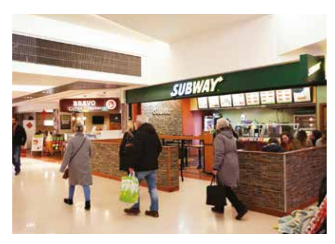
Subway : Sells sandwiches and cookies, it is located on Level 2, near McDonalds